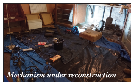
Mechanism under reconstruction

To complete the project the clock company recently returned and installed the new striking mechanism so after at least seven years the clock now strikes the correct time and quarter, half and three quarter periods.