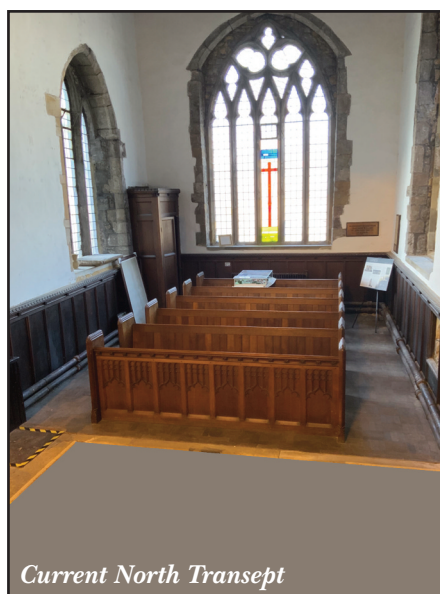
Current North Transept

As part of the Dioceses' Inspired Futures project which we were asked to be part of in 2016 which was established to enable church buildings to be used to their full potential, we have agreed in principal to help the Sedgefield History Society with the conversion of the North Transept into a Heritage Centre. This will require four of the five pews to be repositioned within the church and create a space to be used to display the Society's many archive materials, along with computers, interactive and virtual reality materials