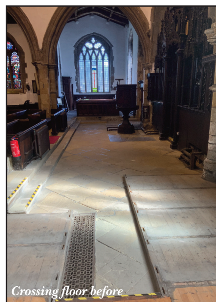
Crossing floor before