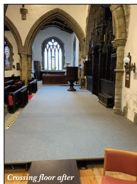
Crossing floor after