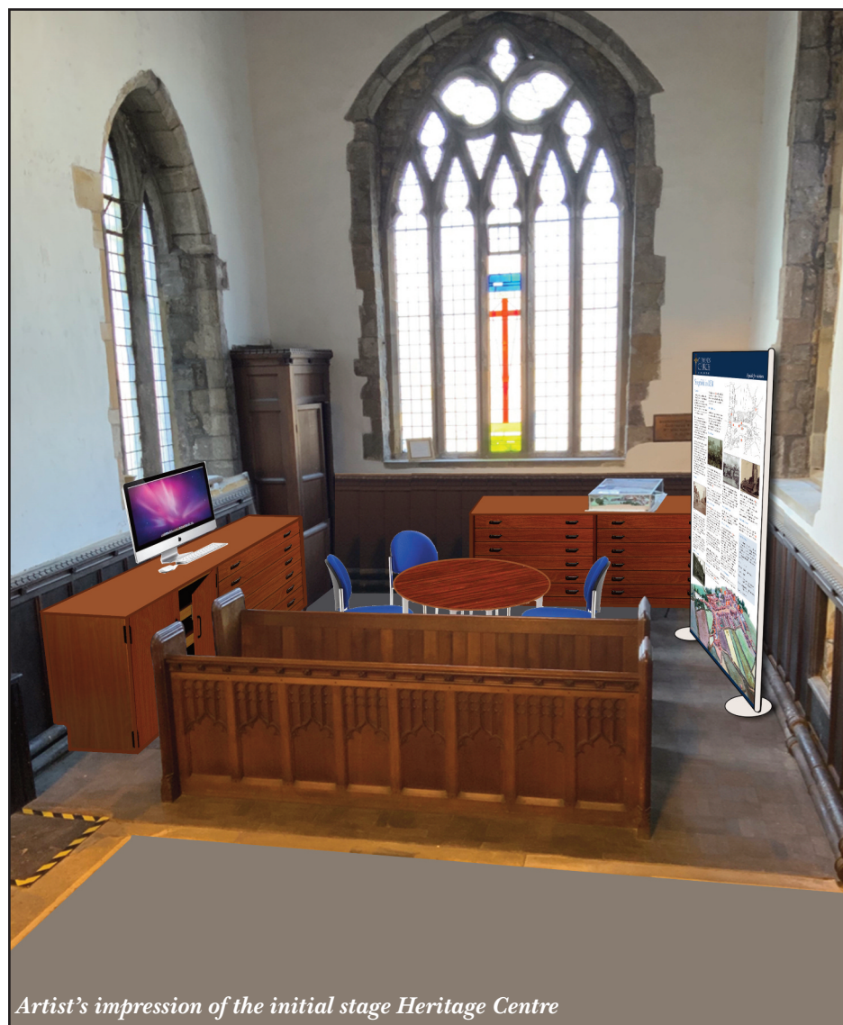
Artist's impression of the initial stage Heritage Centre

This will be achieved by reducing the present vestry area in size, (as it is not used to its full potential these days), by erecting a stud wall with doorway and installing two new toilets.